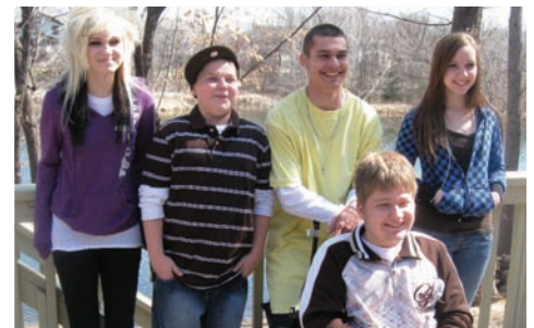
The "big" grandkids

Still, their favorite thing is to watch, interact and enjoy their grandchildren and see how each one grows at different rates and have their own individual skill sets. Mark says, "It is quite a sight to see all of them together; we are truly blessed to have the opportunity to watch them grow and, at times, try and bring wisdom into their lives".