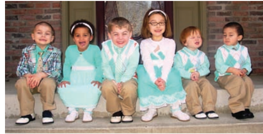
The "little" grandkids